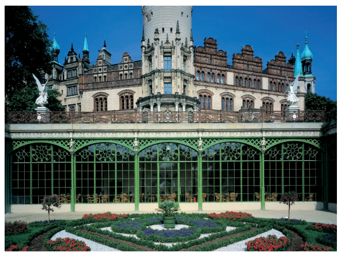
Orangery Schwerin Castle, Schwerin, Germany