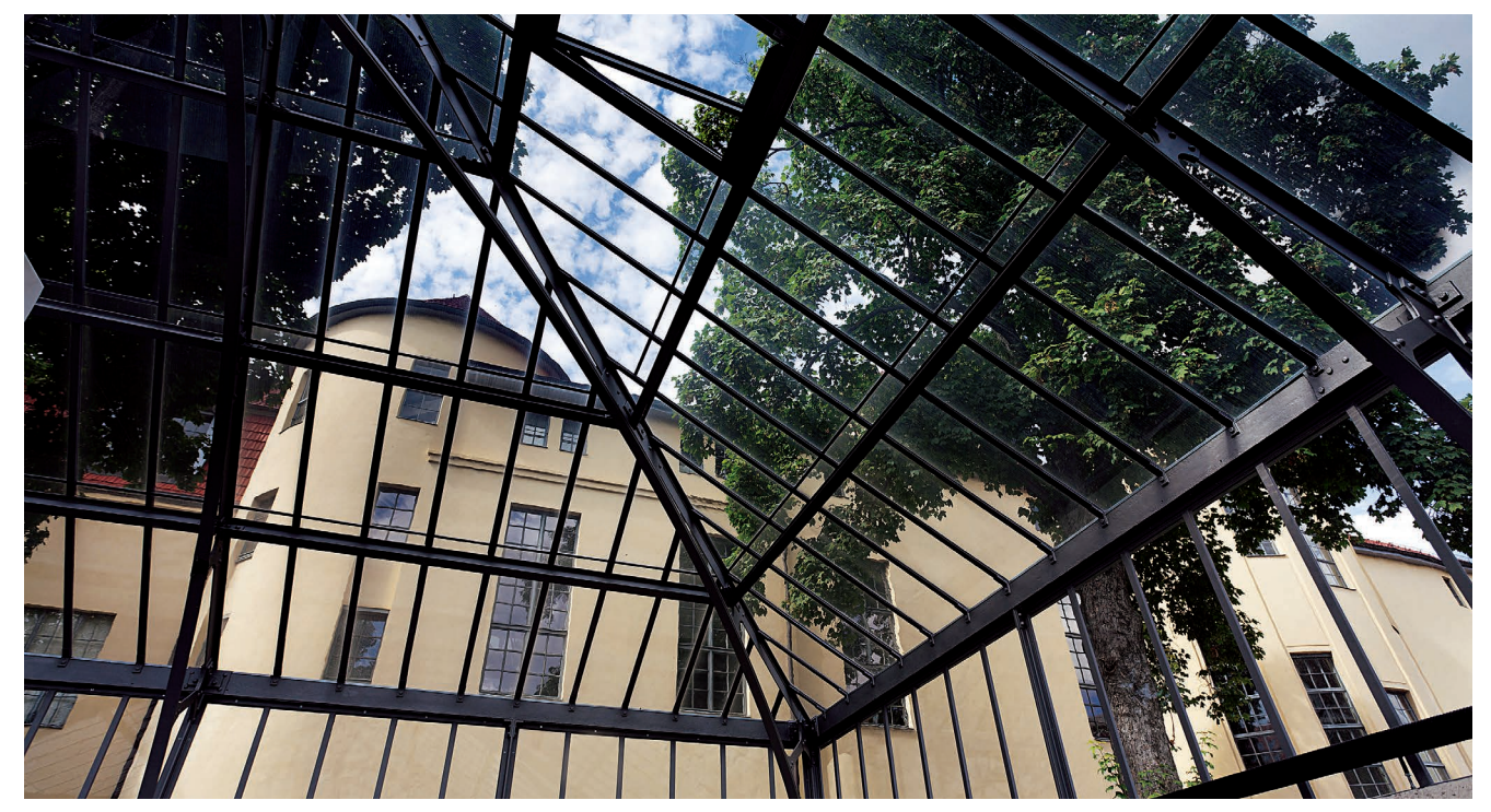
Bauhaus-University Weimar – The Brendel Studio using SCHOTT RESTOVER® laminated glass