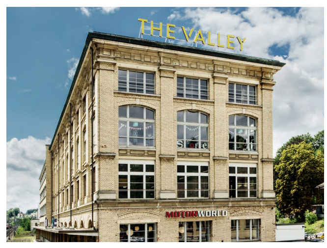
Maggi-Areal, Kemptthal, Switzerland