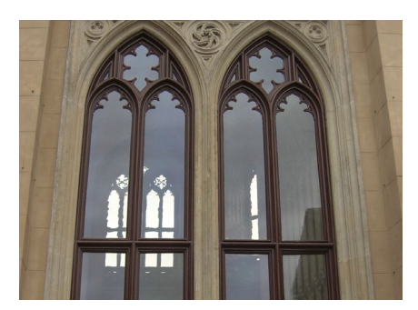
Babelsberg Palace, Babelsberg, Germany