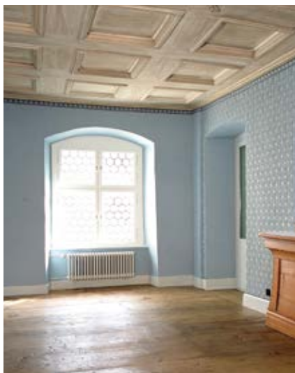
Fittings: tin-plated angled strips Insulating GOETHEGLAS used on the outside