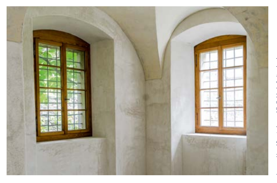
Restored using SCHOTT RESTOVER®, frames made from oiled chestnut wood