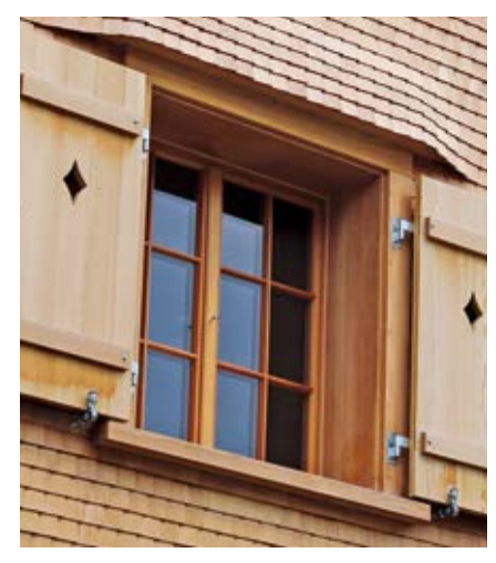
SCHOTT RESTOVER® windows, oiled larch wood frame