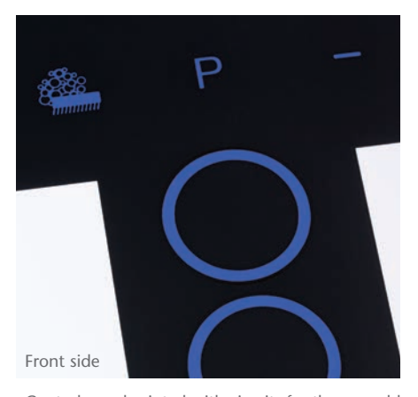
Control panel printed with circuits for the assembly of capacitive sensors