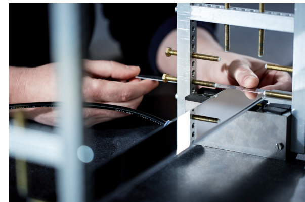
pic_05: Even today precision still requires good manual labor