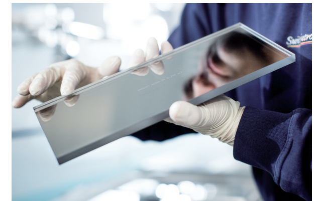
pic_06: Nano-thin reflecting surface during final visual inspection

Editorial use of the photos permitted for this project report only. Please note the photo credits.