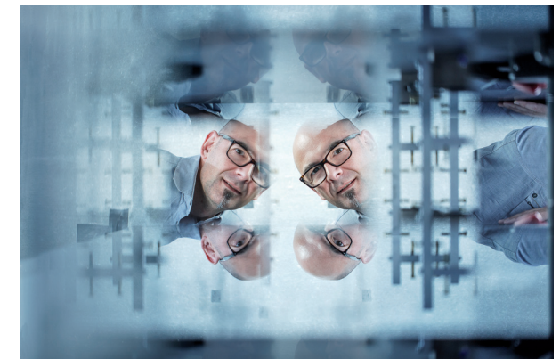
pic_04: Final inspection of the finished neutron guide