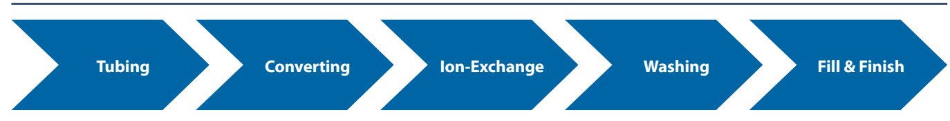
Figure 1 Value Chain

Here, the amount of network modifiers (sodium, calcium, magnesium, potassium) extracted from the inner surface of the glass tubing is compared to the respective amount extracted from the vial (i.e., after converting of the tubing). Since a glass