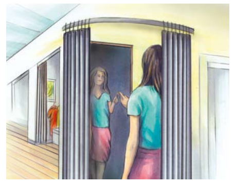
Strong light in the changing room: SCHOTT MIRONA® is an elegant silver shimmering mirror – despite a reflectance of only 34 %.

Are these trousers available in a smaller size? Is this top available in other colours? Which jacket can I combine the jeans I'm just trying on with? The digital sales-assistant is there to answer these questions. And if a product is not in stock, it can be ordered directly via touch display and delivered either to the shop or a customer's home address. The ideal way to combine the strengths of physical retail with the comfort of online shopping.