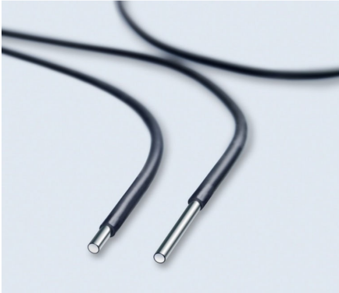
SCHOTT® Image Guide

Meeting market requirements for defect-free endoscopic imaging