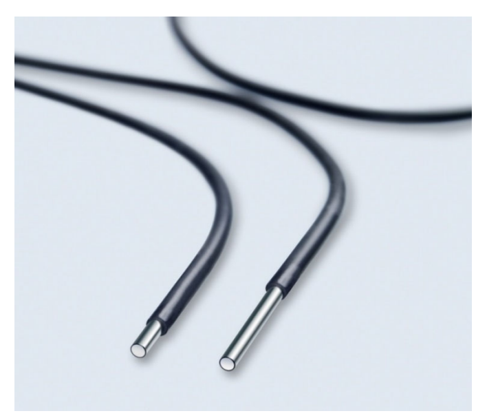
SCHOTT® Image Guide

When imaging hard-to-access locations, high-resolution flexible image bundles provide a unique solution. SCHOTT® Small Diameter Image Guides, also known as Leached Fiber Bundles (LFB), are commonly used in the medical, veterinary and industrial fields for simple and effective visualization and diagnosis. These image guides made of glass optical fibers are supplied to OEMs of endoscopes as well as to repair companies.