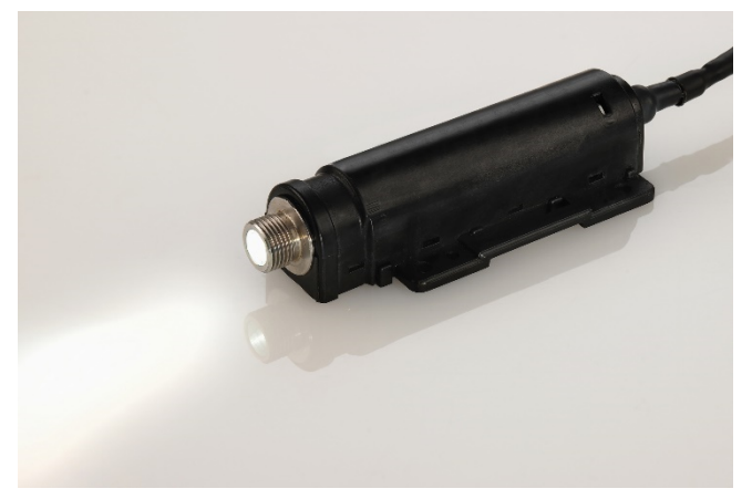
SCHOTT® HelioBasic II

The technology is qualified for all major passenger aircraft.