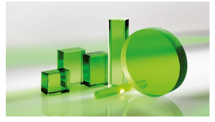
SCHOTT supplies finished components with high-end polish and coating.