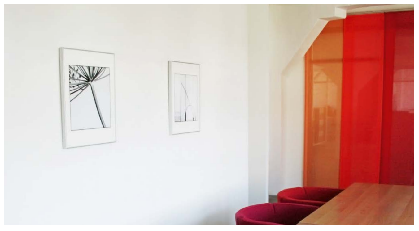
Black-and-white photography displayed with minimal reflections and UV protected by MIROGARD® Anti-Reflective Glass in a living room.