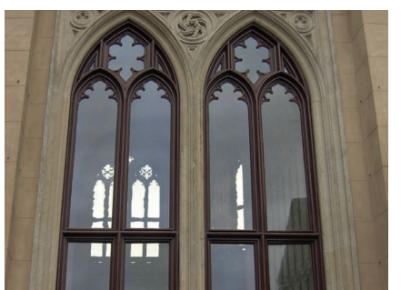
Babelsberg Palace, Babelsberg, Germany