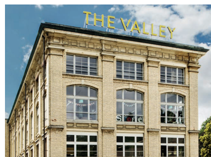
Maggi-Areal, Kemptthal, Switzerland