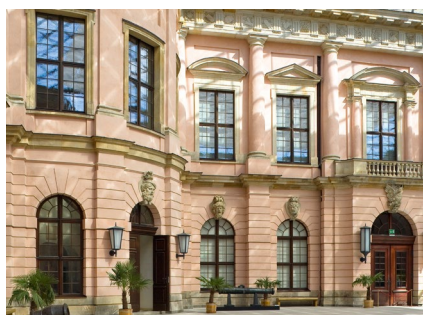
German Historical Museum, Berlin, Germany