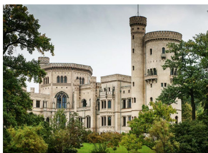
Babelsberg Palace, Babelsberg, Germany

TIKANA® is particularly suitable for buildings in the Bauhaus style. Its slightly irregular surface blends harmoniously into classical modernist buildings. Like the other SCHOTT glass for restoration variants, TIKANA® enables an historical look to be integrated into state-of-the-art structural features.