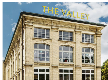
Maggi-Areal, Kempthal, Switzerland