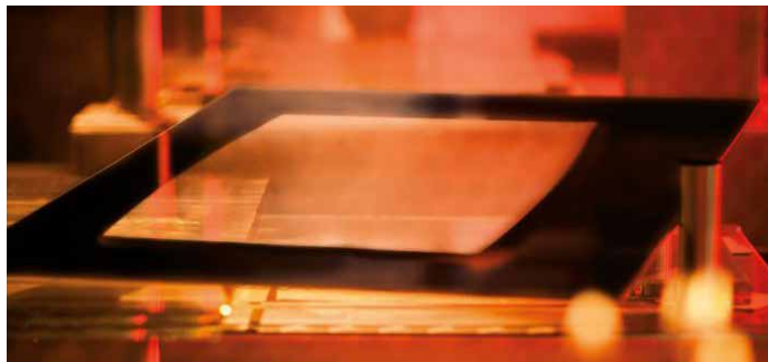
Thermally resistant oven door made with BOROFLOAT® 33.

BOROFLOAT® 33 from Germany is the world's first floated borosilicate flat glass. It combines superior quality and excellent flatness with outstanding thermal, optical, chemical and mechanical features. The chemical composition and physical values of BOROFLOAT® 33 are in accordance with ASTM E 438-92 (2001), Type 1, class A. Rediscover BOROFLOAT® 33 and experience the infinite potential of our most versatile material platform. BOROFLOAT® – Inspiration through Quality.