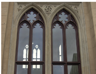
Babelsberg Palace, Babelsberg, Germany