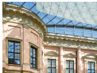
German Historical Museum, Berlin, Germany

GOETHEGLAS is a colorless, drawn glass with the distinctive, irregular window glass surface typical of the 18th and 19th centuries.