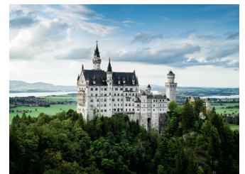
Neuschwanstein Castle, Füssen, Germany

TIKANA® is particularly suitable for buildings in the Bauhaus style. Its slightly irregular surface blends harmoniously into classical modernist buildings.