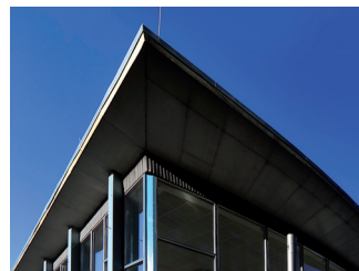
Palace of Tears, Berlin, Germany

RESTOVER® resembles window glass manufactured around 1900. RESTOVER® Light and RESTOVER® Plus can provide a less or more textured surface variant resembling traditional blown glass depending on individual requirements.