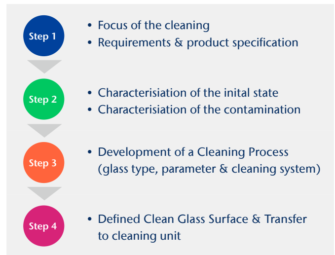
Figure 1: Process chain for the development of a cleaning process.

The characterization of the initial state of the glass sample is important in order to determine the requirements of the cleaning process. The characterization of the glass surface is done by analysis methods like visual inspection, light microscopy, scanning electron microscopy including energy dispersive x-ray micro-analysis, time-of-flight secondary ion mass spectrometry, infrared and/ or Raman spectroscopy.