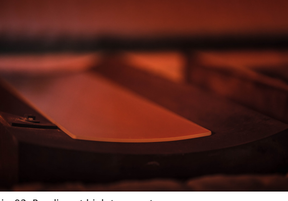
pic_02: Bending at high temperatures