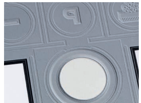
Circuits printed directly onto glass for easy connection to electronic components