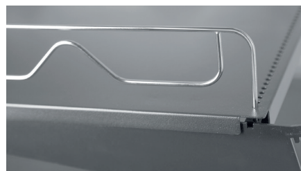
Plate shelf allow spillage to be contained.

Wire shelf. Brackets allow mounting in different angels.