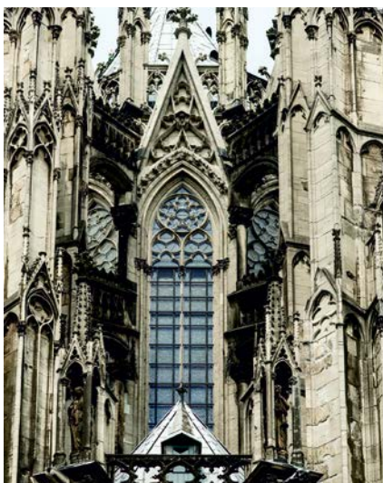
SCHOTT AMIRAN® Heritage Protect

In the spring of 2018, the first upper choir windows in the Cologne Cathedral were fitted with the new SCHOTT AMIRAN® Heritage Protect glazing. More windows are to follow.