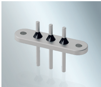
For 200 – 500 V applications