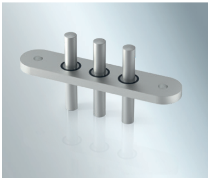
For 24 – 48 V applications requiring higher currents

SCHOTT also offers standard solutions or can design and manufacture customized options to meet specific requirements. Our CompRite® e-Compressor Terminals production facilities are IATF (TS 16949) certified.